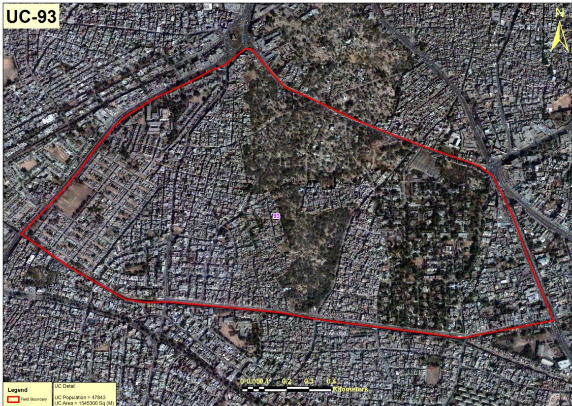
Figure 1: Map of UC 93